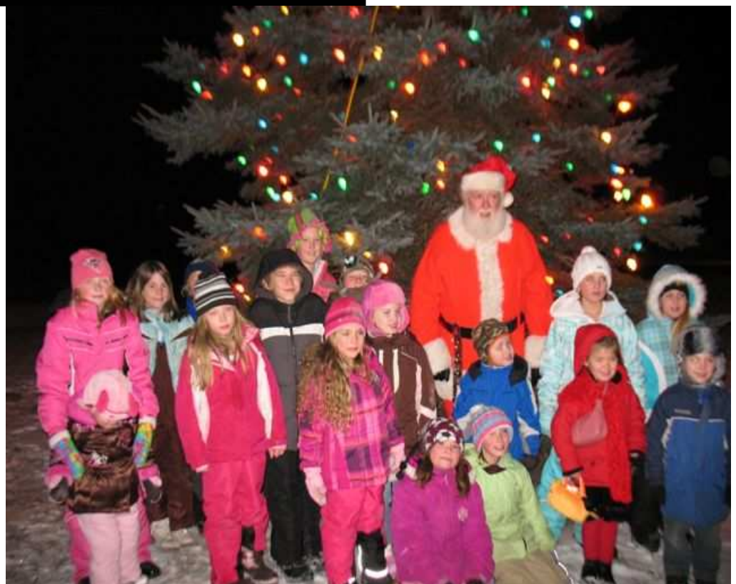
Pictured above: Santa made an appearance in Phelps on December 3rd. He lit the town Christmas tree outside the library and then visited with children from the community at the fire barn. Each child received a gift bag. Everyone enjoyed home-made cookies and hot chocolate.

P.O. Box 217 Phelps, WI 54554 715-545-3800 1-877-669-7077