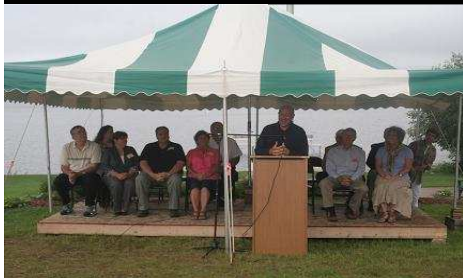
In the photo above, Governor Jim Doyle speaks to the community at the Phelps Open House and Re-dedication on Saturday, August 21.

CHAMBER ANNUAL MEETING AND DINNER SCHEDULED FOR NOVEMBER 2, 2010. DETAILS WILL BE SENT TO YOU SOON!!