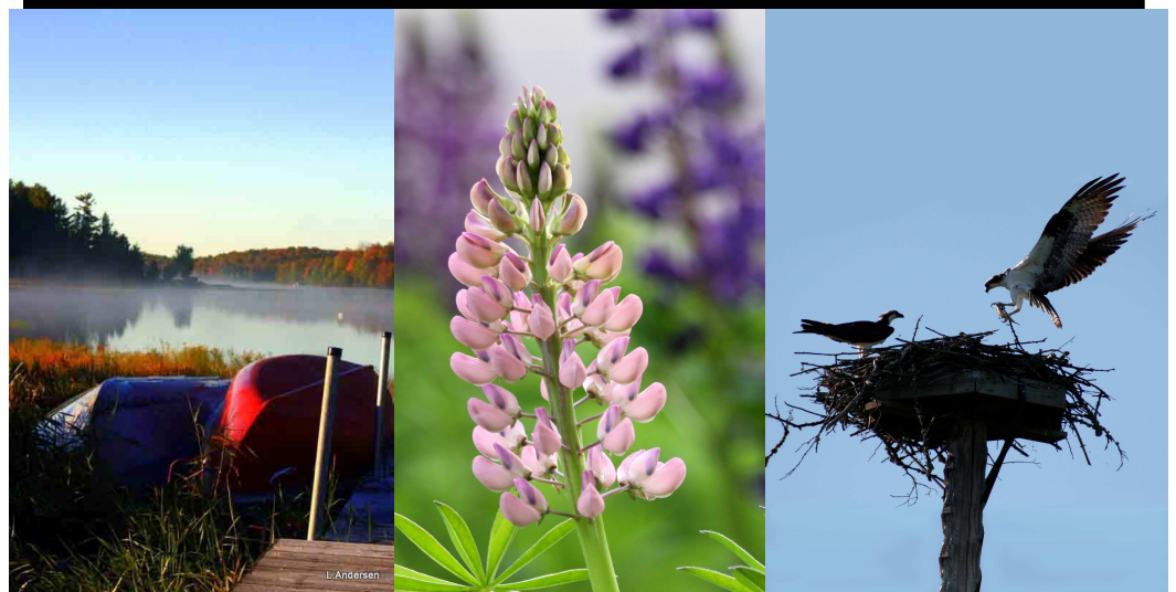
Pictured above: The winning photos—left to right 1st place, 2nd place, 3rd place